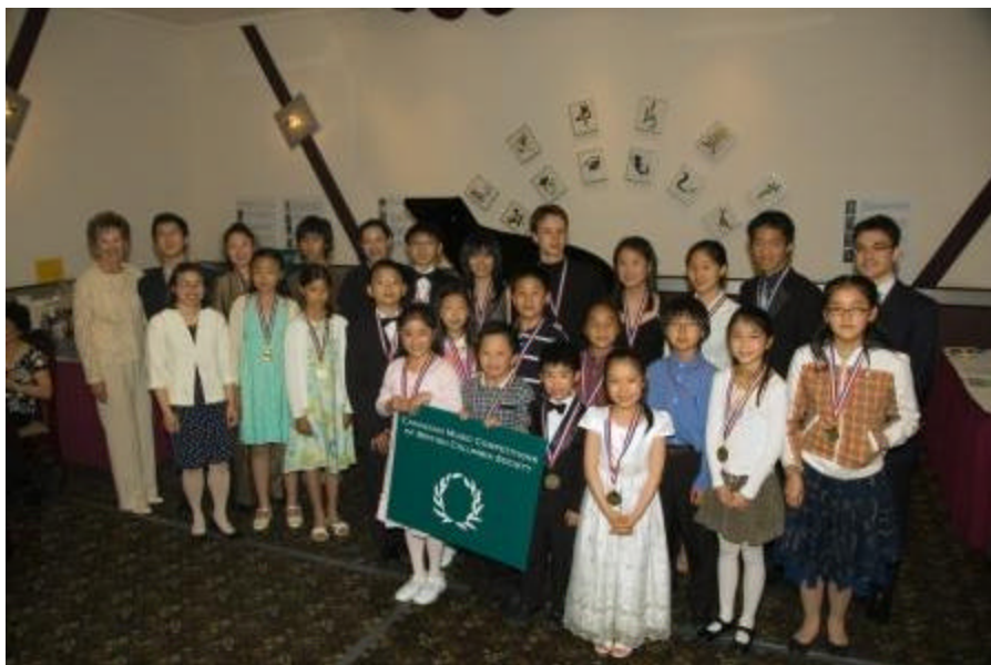
Team BC 2007

CMC BC thanks all its donors and sponsors, particularly HSBC, for their generous support of Team BC. We raised over $6000 to support CMC BC’s operations and programme delivery.